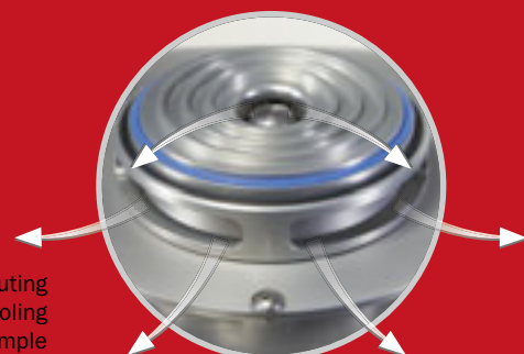
Ingenious air routing for efficient cooling of the sample

Available only from FRITSCH: The ingenious air routing of the PULVERISETTE 14 classic line ensures a constant airflow to cool the rotor, all motor components and the grinding material in the collecting vessel. At the same time, a large fan blows the cooling air into the instrument through a foam particle filter to create positive pressure that prevents the penetration of dirt particles from the ambient air.