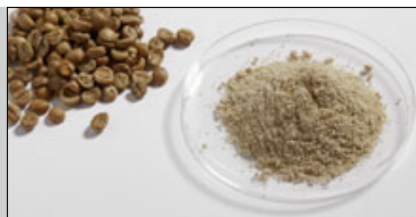
Raw coffee before and after grinding with the P-14 and sieve ring 1 mm trapezoidal perforation at 20,000 rpm

IQ/OQ documentation available to support equipment qualification.