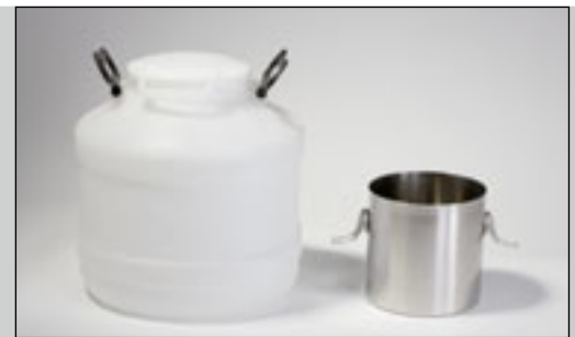
Large collecting vessel 30 l, small collecting vessel 5 l

Grinding insert Stainless steel 16.3080.00 16.3070.00 16.3060.00