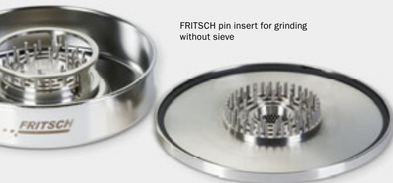
FRITSCH pin insert for grinding without sieve

Another suggestion: During grinding of temperature-sensitive samples, the conversion kit for grinding large quantities with its large nylon support sack ensures a high air throughput, resulting in even better cooling.